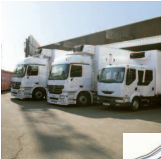
ACCESS TO THE LP ART WAREHOUSE IN PARIS